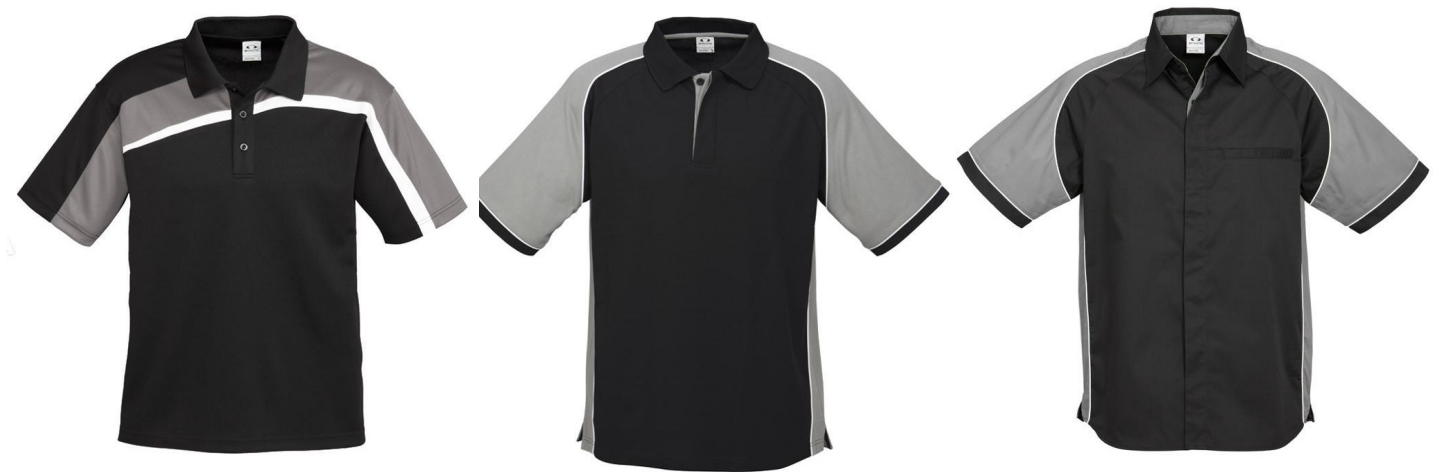
1. Current Convention Uniform